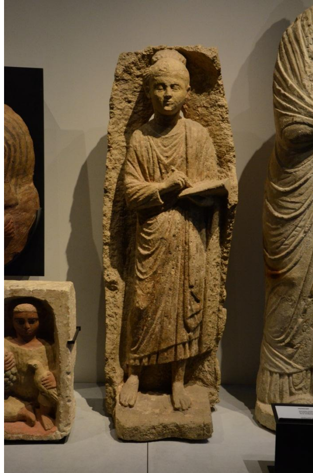
Fig. 5: Stele of a boy from Oxyrhynchus. Leiden, Rijksmuseum van Oudheden, Inv. No. F1972/8.1 (after Thomas 2000: 24, fig. 73)

ornaments or jewelry that are conceived as intrinsic features of female representations. 1 A similar gravestone kept in the Rijksmuseum van Oudheden in Leiden (F1972/8.1) (Fig. 5) depicts a standing figure that is evidently a boy, with the same hairstyle, carved as straight locks pulled back and gathered in a big knot at the back of the head, and the same kind of long-sleeved tunic. The Leiden gravestone comes from Oxyrhynchus and is dated to the 3rd–4th century AD. 2 It is worth noting that both boys' and girls' mortality was high in Roman Egypt. 3