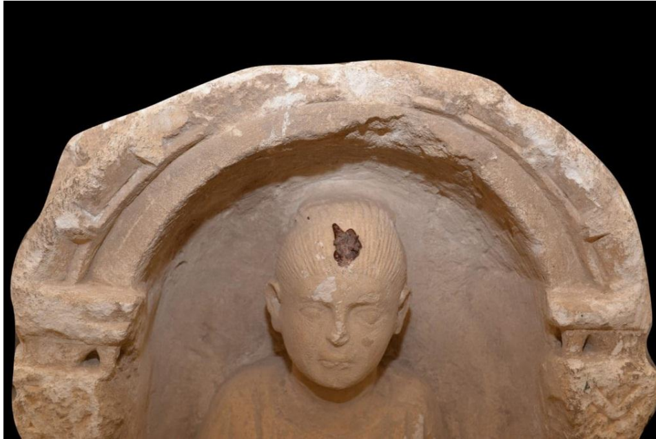
Fig. 4. Detail of the gravestone: the apsed niche with entablature decorated with distinctive Alexandrian modillions

forms are a distinctive feature of Alexandrian architectural decoration, 1 found only in Alexandria or on sites influenced by Alexandrian motifs. 2 (Fig. 4)