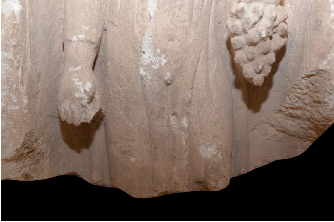
Fig. 2. Detail of the objects held in the figure's hands: a bunch of grapes in the left, a possible floral garland in the right

The boy's head is relatively big, set on a smooth neck. The face is round, the cheeks apparently fleshy, the nose straight and short, although partly damaged. The mouth is small above a flat chin. The eyes are almond-shaped, plain, without indication of iris or pupils, the eyebrows are arched but without indicating the hair. The forehead is plain, without any wrinkles. The ears are well-carved and symmetrical. The hair is executed as straight locks pulled back smoothly and gathered in a big knot at the back of the head. (Fig. 3)