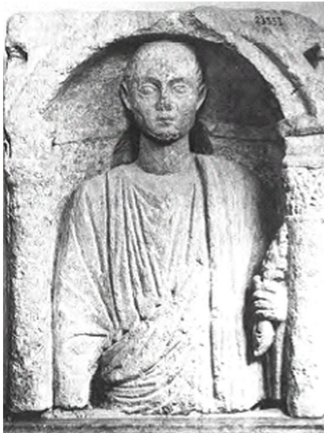
Fig. 6. Funerary stele of a man from the Graeco-Roman Museum at Alexandria (after Schmidt 2003: Kat. Nr. 165. Inv. Nr. 23553, p. 146, Breccia 1933: 61, pl. XXXIX-139).

The most unique feature of this gravestone are the two holes in the sides of the niche. The two stelae with a similar embellishment from the Graeco-Roman Museum at Alexandria were attributed by Breccia to Oxyrhynchus. The first ( Fig. 6 ) depicts a standing male figure with the same richly-carved niche similar to the stele here discussed. The two triangular holes are cut in the spandrel and there is an extra big hole behind the head, probably used for a floral garland hung around the neck. This stele is dated to the 3rd-to-4th century AD. 2