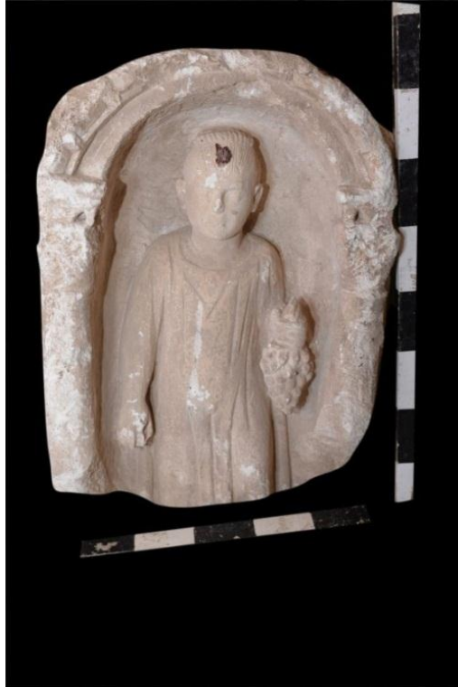
Fig. 1: Gravestone of a boy. Limestone, H.0.52 m; W.0.37 m; Th. 0.20–0.21 m. El-Ashmunein Archaeological Magazine/Storeroom (Inv. no. 644)

The figure on the gravestone is that of a standing boy in frontal pose, the head turned slightly to the right. He is dressed in a simple long-sleeved tunic with a big round neckline. The carving of the garment folds is shallow, straight over the shoulders and arms, V-shaped on the chest. The lines of the body are clearly executed under the folds of the dress and the navel is also to be seen under the fabric. The right arm hangs straight down but is not pressed to the body. The object held in the right hand may be a floral garland. The left arm is bent at the elbow, the hand clutching bunch of grapes. (Fig. 2)