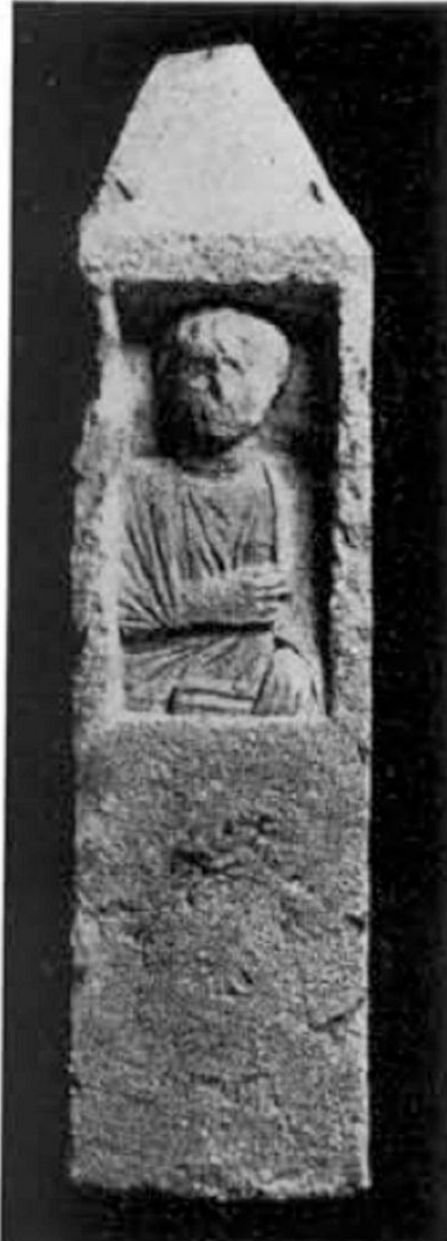
Fig. 7: Funerary stele of a man, preserving triangular holes in the pyramidal top, Graeco-Roman Museum at Alexandria (after Schmidt 2003: Kat. Nr. 167. Inv. Nr. 23375, p.150)

The second example ( Fig. 7 ) is a square niche with pyramidal top, inside which there is the carved depiction of a man dressed in a simple tunic and himation of the arm-sling type. Triangular holes can be seen at the top of the stele and are presumed to be there for inserting a floral garland. 1